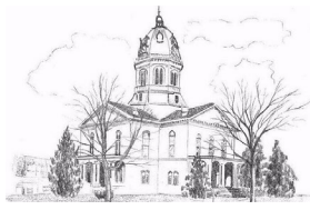
Courthouse at Winterset Madison County, Iowa Built in 1876 of native limestone.