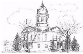
Courthouse at Winterset Madison County, Iowa Built in 1876 of native limestone.