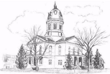
Courthouse at Winterset Madison County, Iowa Built in 1876 of native limestone.